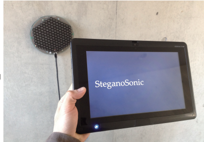
Figure 2: Prototype System.